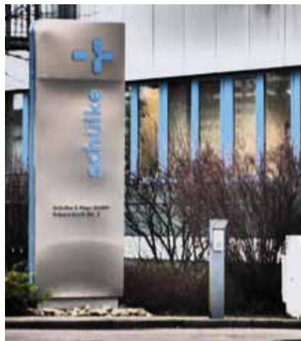
Schülke & Mayr Headquarters in Norderstedt near Hamburg, Germany.

Since the bulk of the products from Schülke & Mayr are used for medical, clinical or pharmaceutical purposes, the company is officially classified as a pharmaceuti-