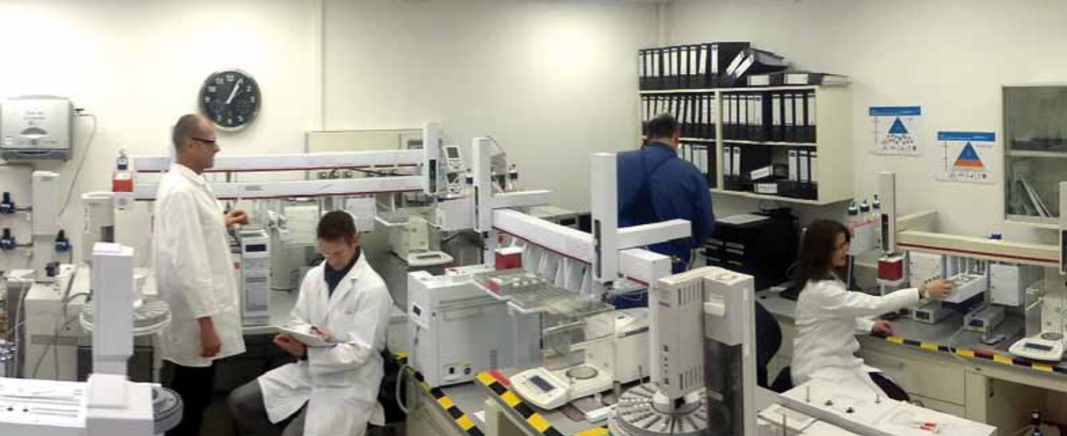
A view of the Schülke & Mayr laboratories.