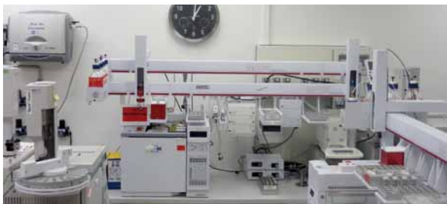
Every GERSTEL MPS in the Schülke & Mayr laboratories is equipped not only with a Weighing Option, but also with two towers (Dual Head version) in order to accurately dispense a wide range of volumes without having to go through the process of changing syringes. “The Bridge”, an XL version of the MPS spans two GC systems. Prepared samples can be introduced to the GC on the left and vials with prepared samples can be placed into the autosampler of the GC on the right hand side.

as replacement of consumable parts can be scheduled. This helps to ensure that the laboratory always delivers reliable and accurate data. “Without a weighing option,” says the expert, “A regular or ongoing system monitoring and control would never be this easy – or even possible.”